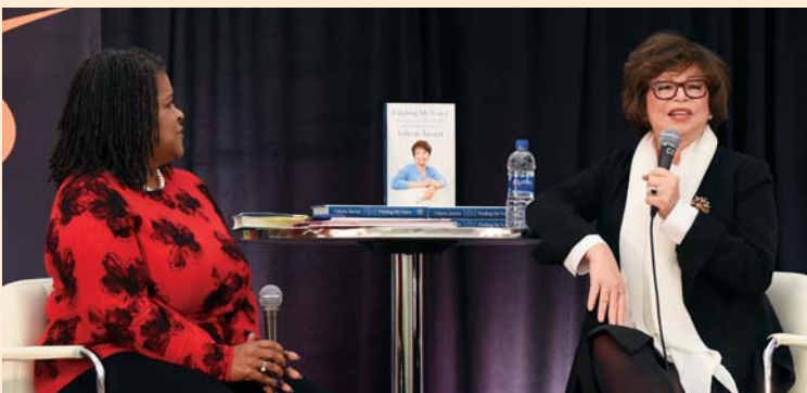
Valerie Jarrett, Black History Month keynote address at Headquarters.

A total of 43,417 new cardholders were added in 2019, including 569 via the Born To Read program.