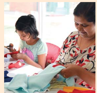
Crafting at Samuel C. Sachs.