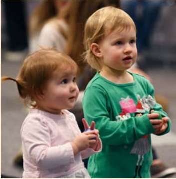
Laptime at Headquarters.

Visits to the library in 2019 totaled 5,158,881. This is 3% higher than in 2018. There were a total of 1,880,903 holds placed, and 1,472,547 holds filled.