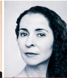
Laila Lalami Wednesday, May 13