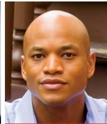
Wes Moore Thursday, April 30