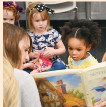
Mother Goose Ballet at Prairie Commons.