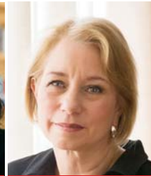
Laura Lippman Friday, May 8