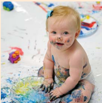
Baby Art Crawl at Grant's View.