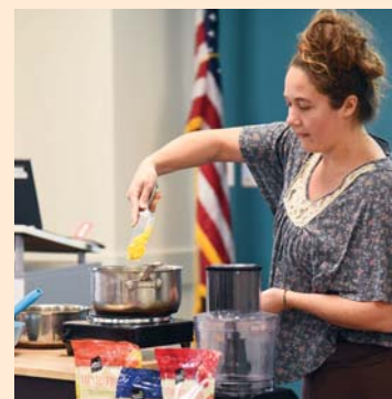
Cooking Club at Mid-County.

Three new branches opened in 2019: Thornhill, Meramec Valley and Mid-County.