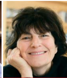
Ruth Reichl Saturday, May 2