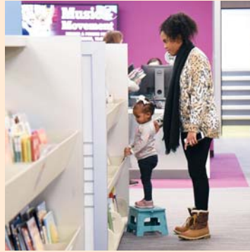
The Discovery Zone at Daniel Boone.

Program attendance at all branches of SLCL during 2019 was 565,479 an increase of 13%.