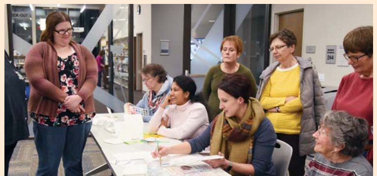
Painting with a Snappy New Day at Meramec Valley.