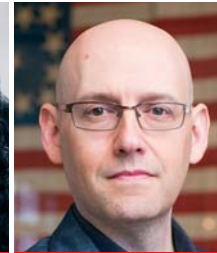
Brad Meltzer Friday, May 15